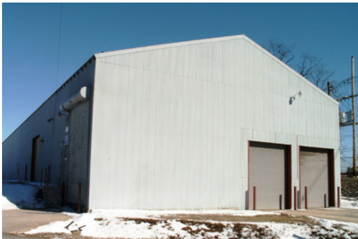
150 Derbyshire St