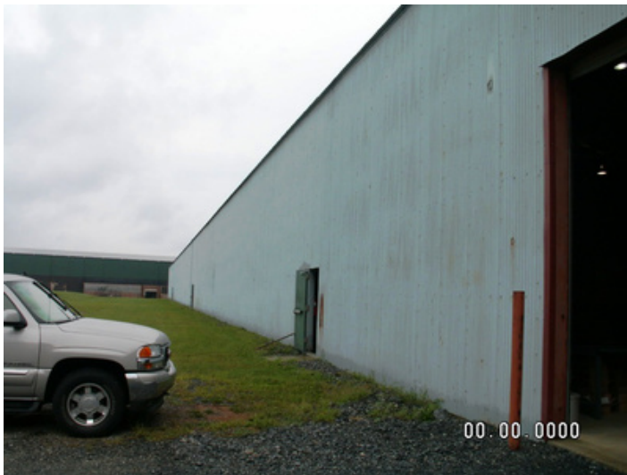
150 Derbyshire St